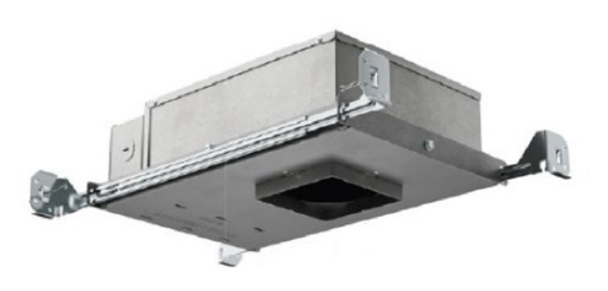
Figure 1. ENTRA CL3